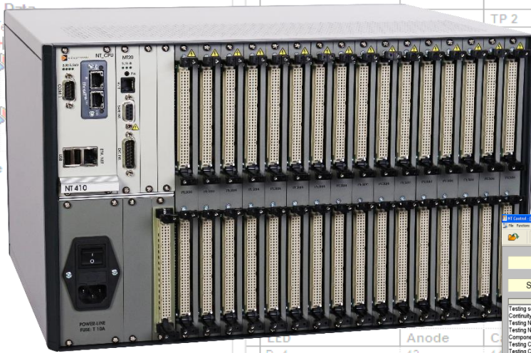
Example: NT 410